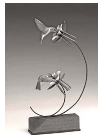
Rusty Rutherford– ruby-throated humming birds