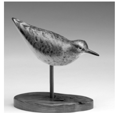
Spotted Sandpiper by Frank MacFarlane-Ross Gage Award

PCCA is in the process of updating its list of 08 carving clubs, competition and courses. It is perfect document to help promote the art form. Visit our website or contact Ted Muir for a free copy.