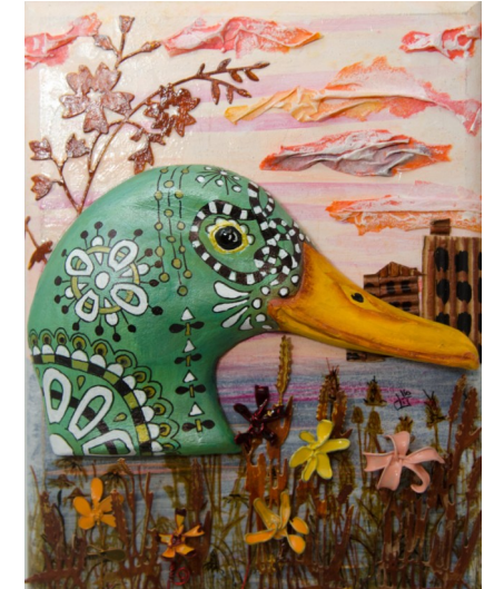
Decorative Duck Head by Doreen Light 3rd Most Creative