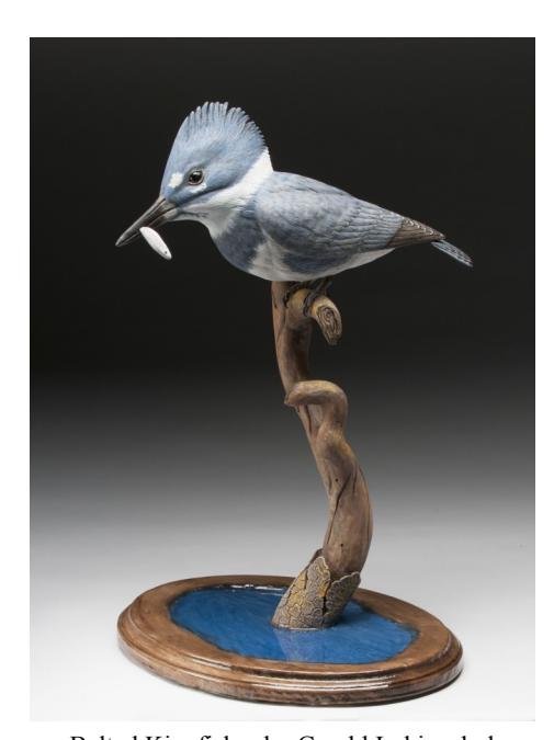
Belted Kingfisher by Gerald Lukianchuk 1st Best of Show Birds Novice