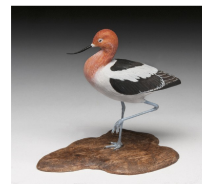
American Avocet by Austin Eade Best of Show Cocktail

We thank all the carvers for their generosity.